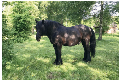
North Swedish Work Horse