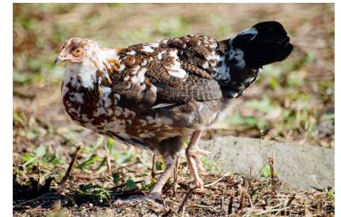
Scanian Flower Hen