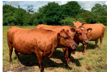
Swedish Red Polled Cow